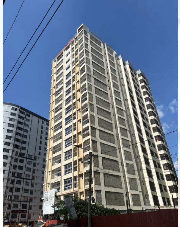
CROSS ROAD II EASTLEIGH