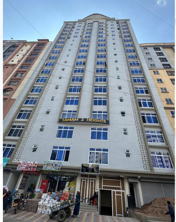
TAMAM II APARTMENT EASTLEIGH