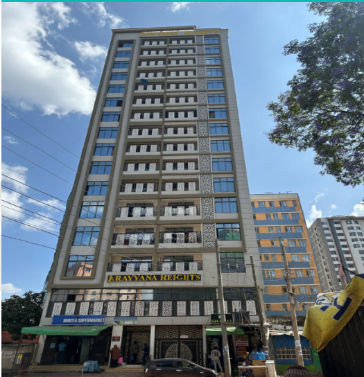
RAYAN HEIGHTS EASTLEIGH