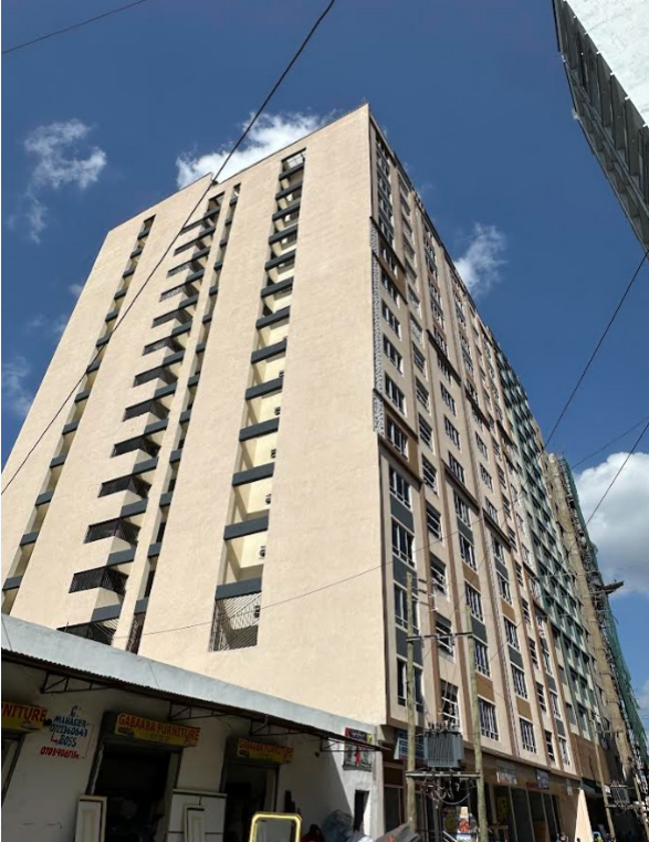
USHIRIKA APARTMENT EASTLEIGH