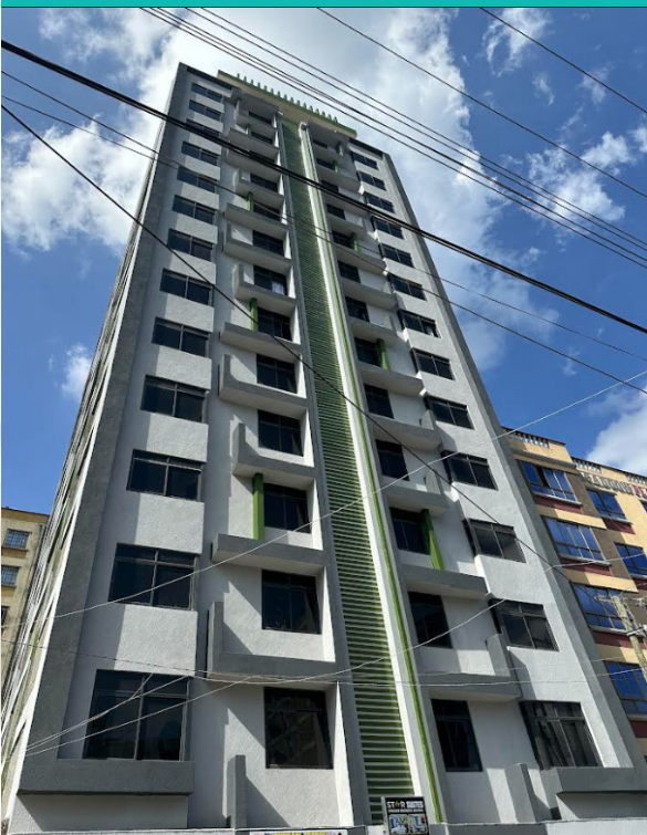
8TH STREET EASTLEIGH