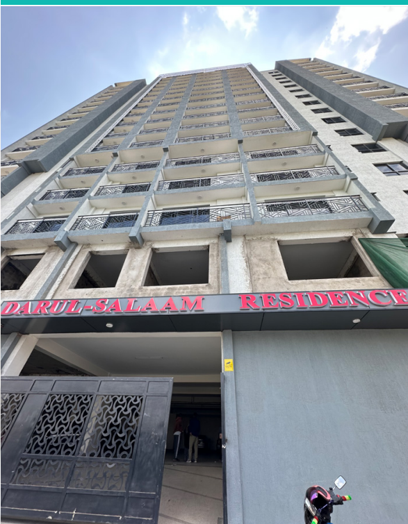
DARUL -SALAM RESIDENCE SOUTH C