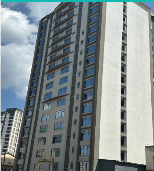
SAGAL II PANAGANI