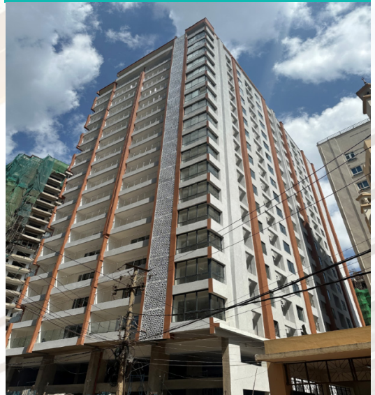
KHALIL APARTMENT PARKLANDS