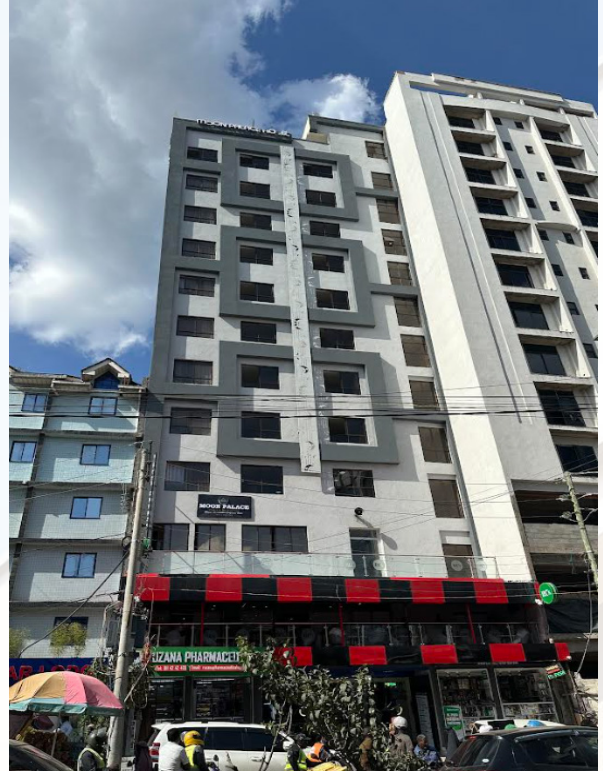
12TH STREET EASTLEIGH