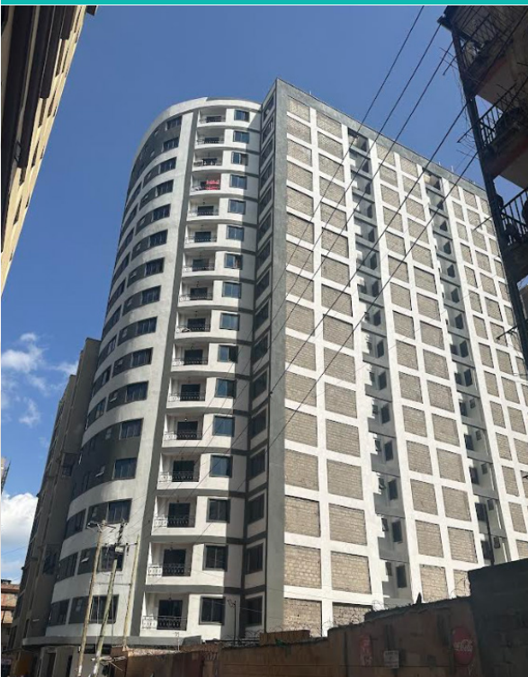
AHLAM APARTMENT EASTLEIGH