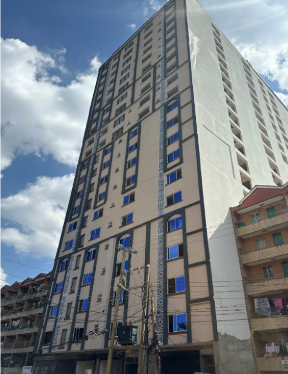
NAIROBI TOWERS PANGANI