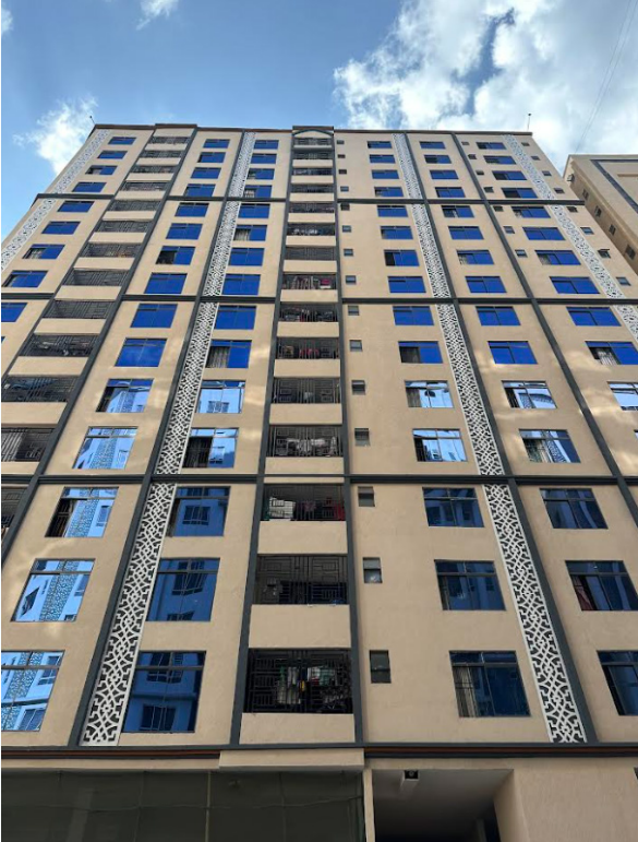
BANGAL APARTMENT EASTLEIGH